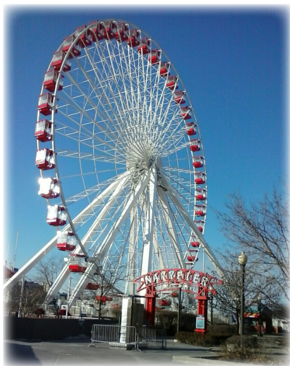
The Ferris Wheel at the Navy Pier is an iconic landmark in Chicago.

During the MW meeting, the American Association of School Librarians (AASL) distributed information about a "School Library Programs Improve Student Learning" advocacy initiative and "Beyond Words: the Dollar General School Library Relief Fund" for grant opportunities. Council heard a report from the Freedom to Read Foundation and learned about the new "I Love Libraries" interface featuring advocacy content targeted at library stakeholders. The ALA Legacy Society sponsored coffee and pastries for Council to promote donation opportunities. Additional information about all of these projects can be found on ALA's website.