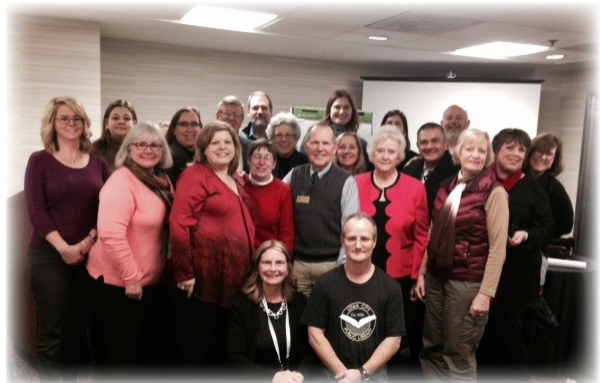
ALA Chapter Leaders Forum