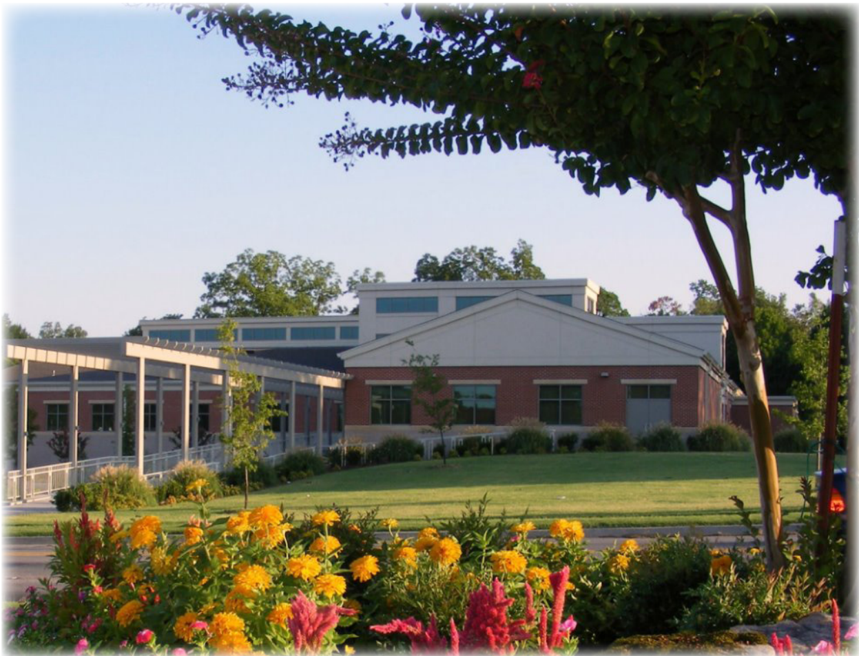
Spring at the Van Buren Public Library.

A reminder to Arkansas librarians: please submit news items to me for the next Arkansas Libraries issue! Births, deaths, new hires, retirements, funding, new buildings, and news that affects Arkansas libraries would be perfect fits for this column. Just jot me an email at hhays@bentonvillear.com , and you'll most likely see it published in our journal.