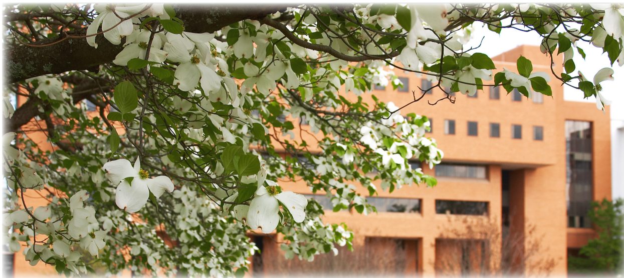
Spring at the UAMS Education Building in Little Rock.

For more information see http://sites01.lsu.edu/wp/slis/ .