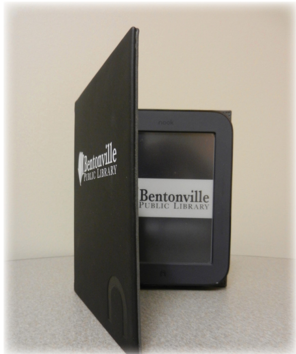
A Bentonville Public Library patron uses one of the NOOK e-readers purchased with a $12,500 grant from the Walton Family Foundation.