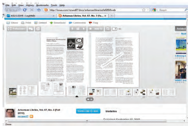
The new look on the Arkansas Libraries journal on-line.