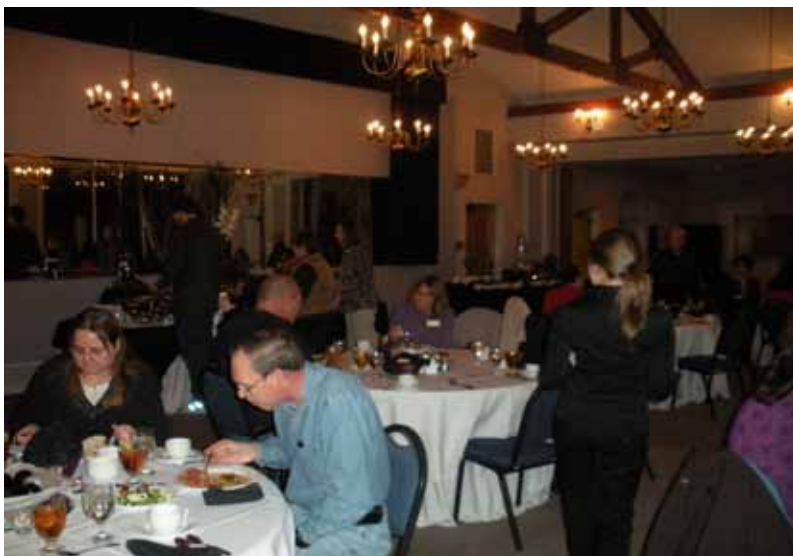
Dinner was a Cajun buffet -- yummy!