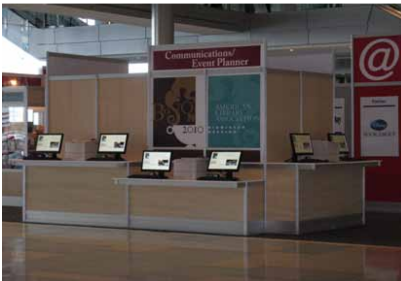
ALA Midwinter in Boston There were computers available to keep in touch with the folks back home.