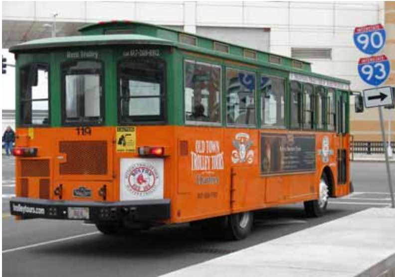
ALA Midwinter in Boston Sampling local restaurants was easier thanks to the Dining in the Neighborhood Trolley.