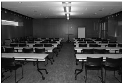
Bessie B. Moore Conference Room

900 West Capitol Avenue Suite 100 Little Rock, AR 72201-3108