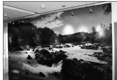
Mural of Cossatot River

Check our Web site, www.asl.lib.ar.us , or watch the Arkansas library listservs for an announcement about an upcoming Open House for the building.