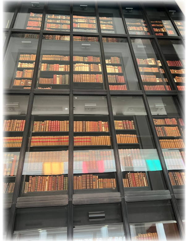
The King's Library of George III tower at the British Library.