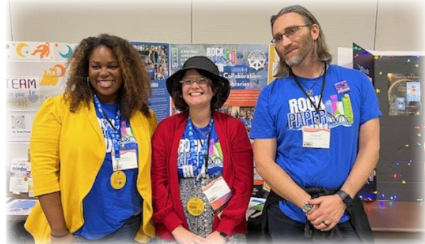
Conference poster session. See article on page 6.