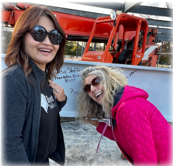
The Bentonville Public Library team celebrated with city staff, library supporters, and the Bentonville community at a recent topping out event.