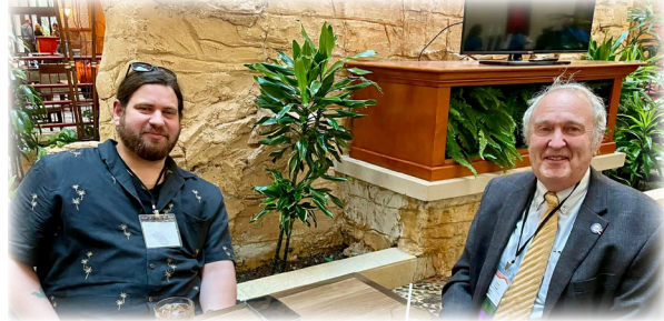
ArLA/SELA Conference attendees. See article on page 6.