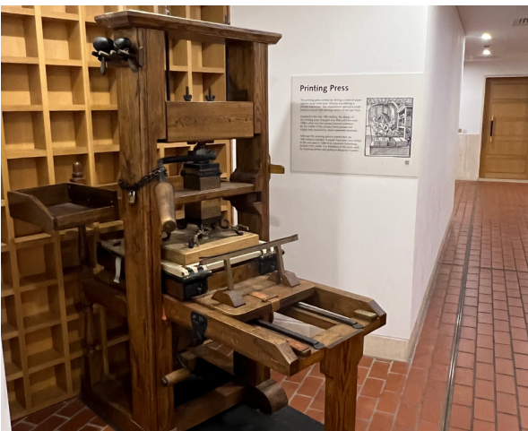
An early printing press at the British Library.

Welcome book lover, you are among friends.