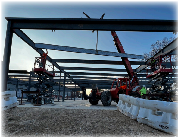
The final steel beam was hoisted into place for Bentonville Public Library’s expansion project on November 17.

Bentonville Public Library’s expansion is comprised of a 22,975 square-foot addition, with renovation of existing spaces and outdoor amenities planned. The project budget is $16.75M and is being funded through a $4.5M city bond extension and private fundraising efforts. BPL’s expansion team includes MSR Design, Hight Jackson and Flintco, along with other regional firms and contractors. Bentonville Public Library broke ground on April 27 and will celebrate its grand opening next summer.