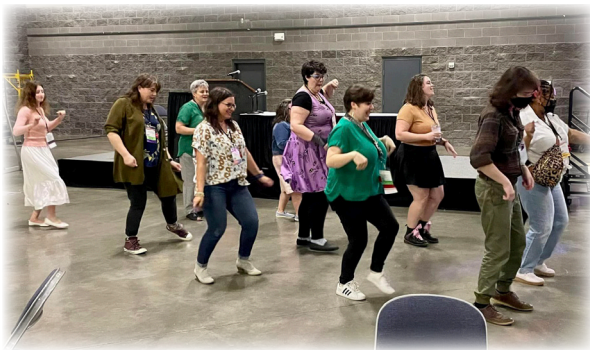
Conference dance party.