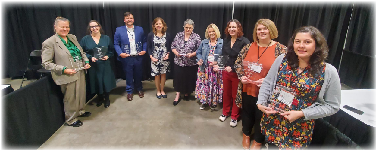
2023 Award Winners.