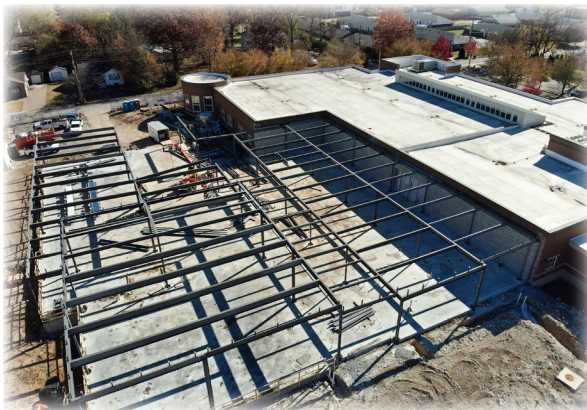
Bentonville Public Library’s expansion is a 22,975 square-foot addition. Aerial construction photo by Jeremy Metcalf, Bentonville Fire Department.