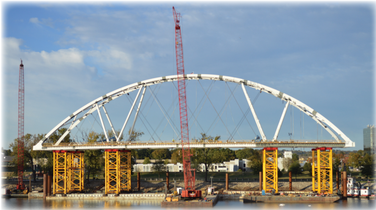
A span of the new Broadway Bridge was put into place as the Conference ended.