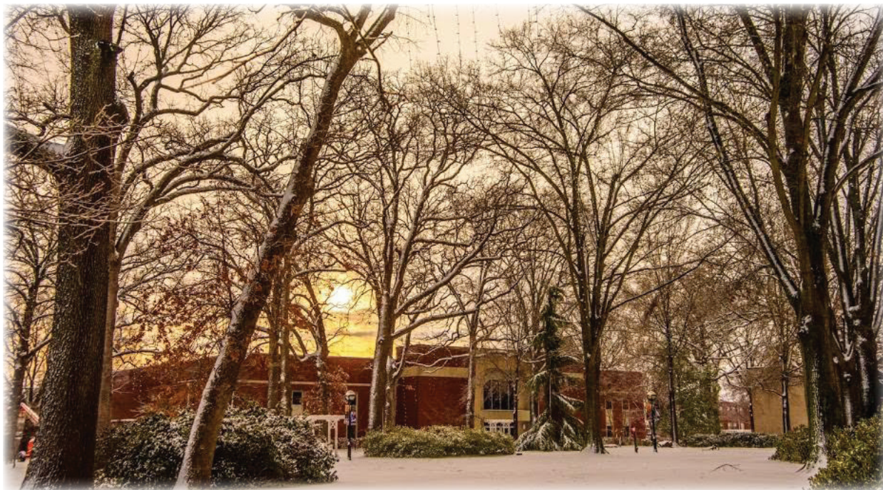
Winter scene at Brackett Library, Harding University.

A reminder to Arkansas librarians: please submit news items to me for the next Arkansas Libraries issue! Births, deaths, new hires, retirements, funding, new buildings, and news that affects Arkansas libraries would be perfect fits for this column. Just jot me an email at hhays@bentonvillear.com , and you’ll most likely see it published in our journal.